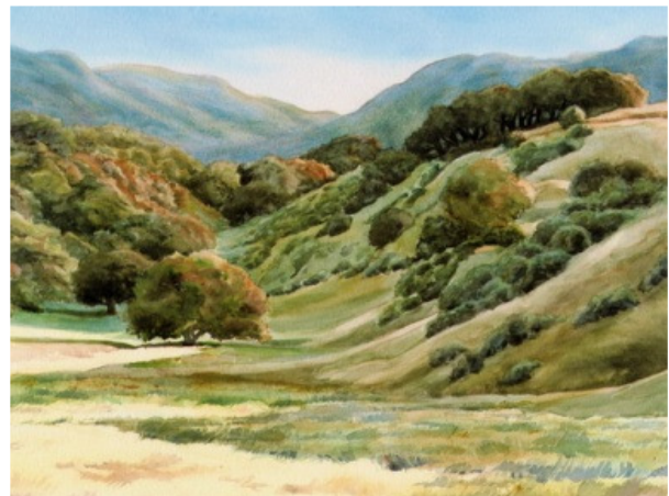
“Oak Canyon”-Rosanne Seitz