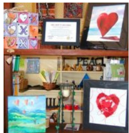
right-Hearts on display at the Halcyon Store.