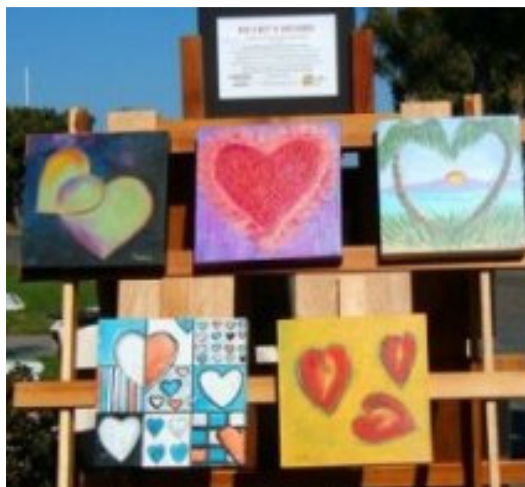
left-Hearts on display at a Santa Maria Summer Concert Series event.